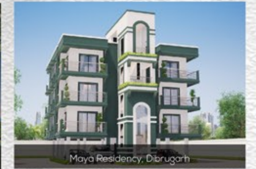
Maya Residency, Dibrugarh

Famously called as the Amar Construction Company leave a spark of imagination in every creation it upholds. Amar Construction Company has played a significant role in changing Dibrugarh's skyline. With a team of skillful and experienced architects, engineers Amar Construction Company have discerning head on broad shoulders.