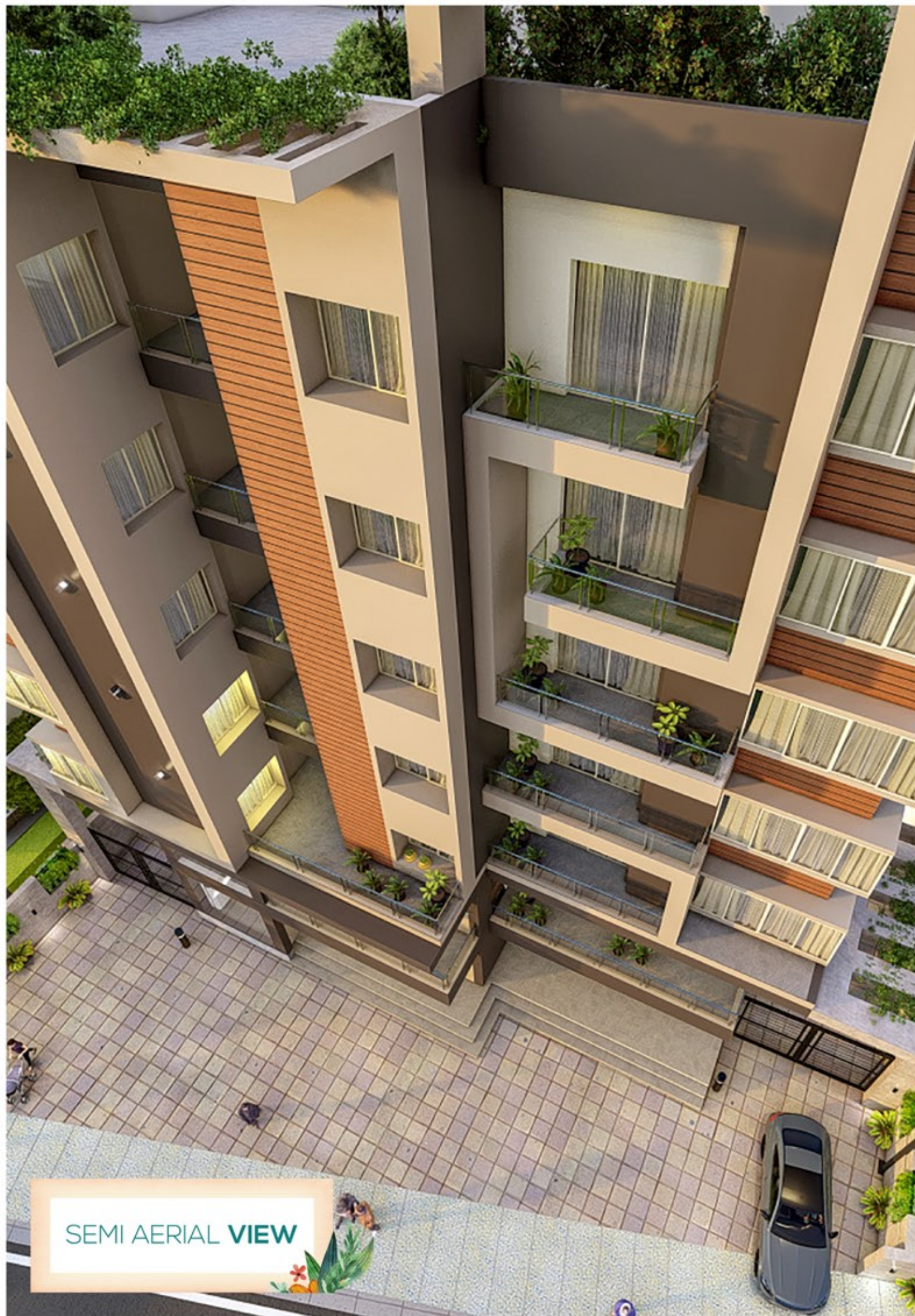
SEMI AERIAL VIEW