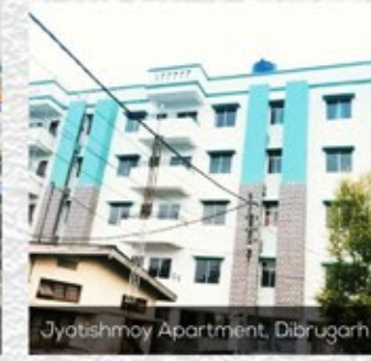
Jyotishmoy Apartment, Dibrugarh