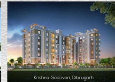
Krishna Godavari, Dibrugarh