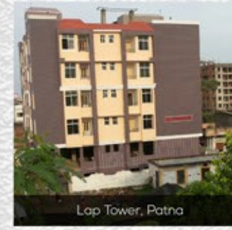
Lap Tower, Patna