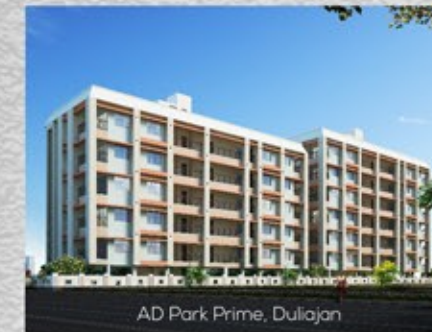
AD Park Prime, Duliajan