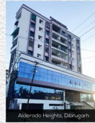
Alderado Heights, Dibrugarh