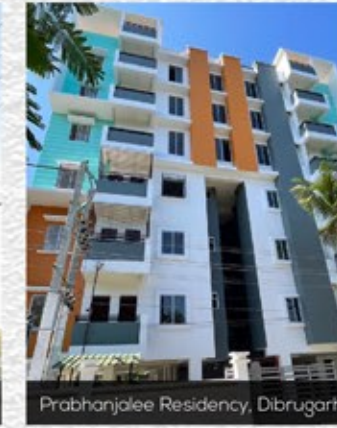
Prabhanjalee Residency, Dibrugarh