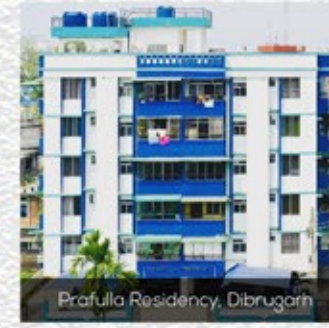
Prafulla Residency, Dibrugarh