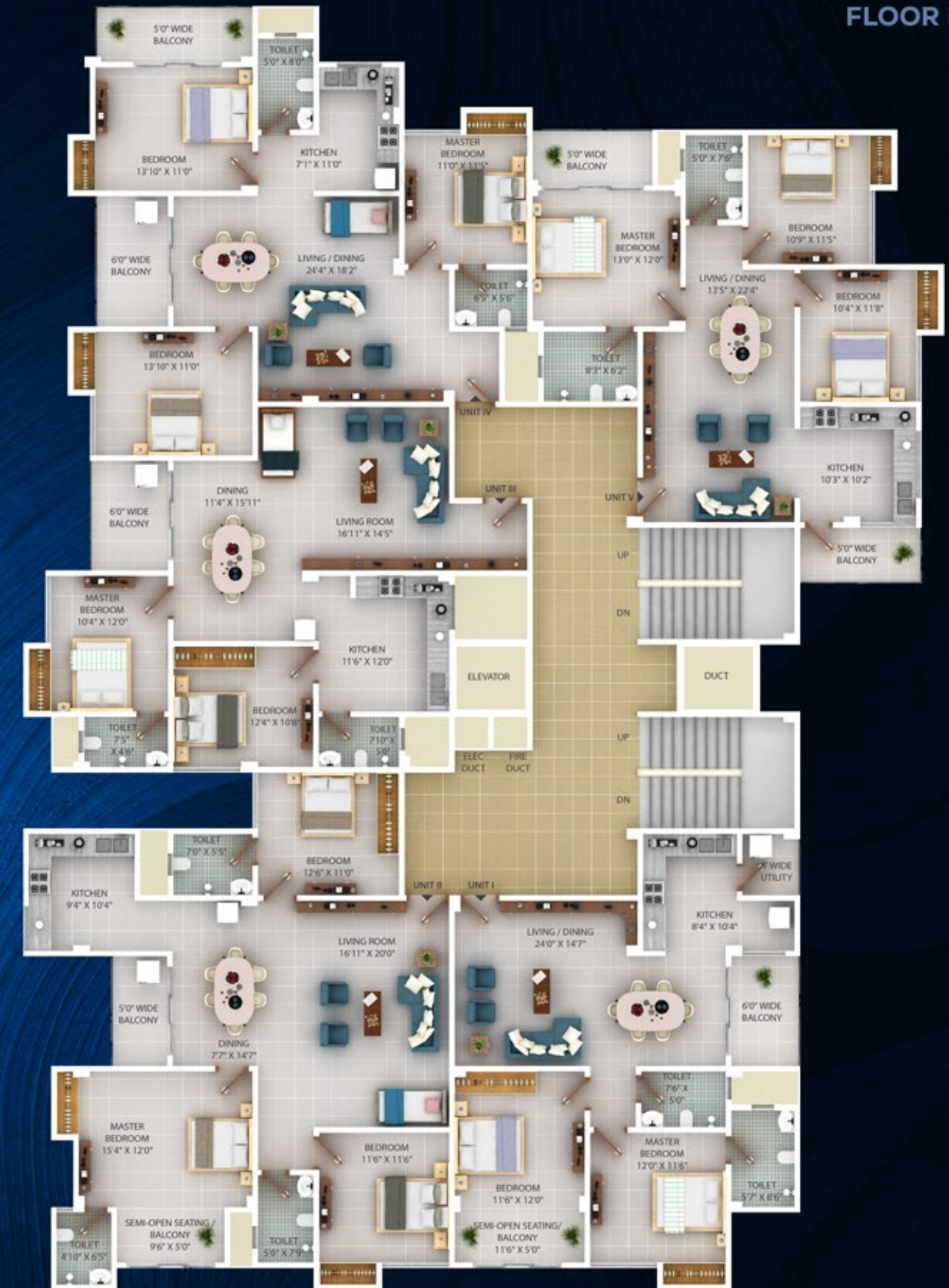
1ST TO 6TH TYPICAL FLOOR PLAN