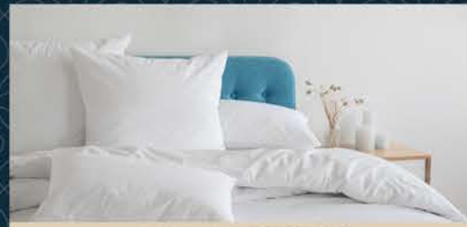
2 BHK APARTMENTS