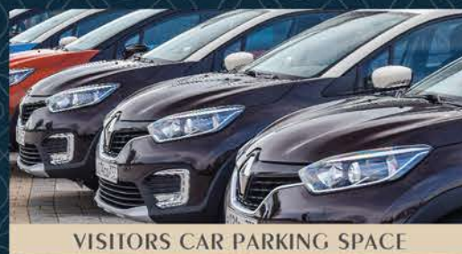
VISITORS CAR PARKING SPACE