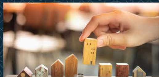
APARTMENT OF 16 UNITS