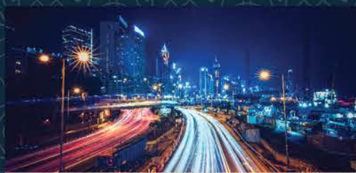
LOCATED AT POSH RESIDENTIAL AREA