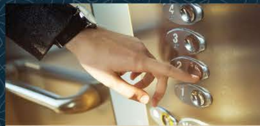
G+4 BUILDING WITH LIFT FACILITY