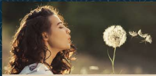
45% OPEN AREA