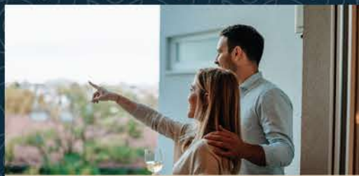
2 SIDE OPEN APARTMENT